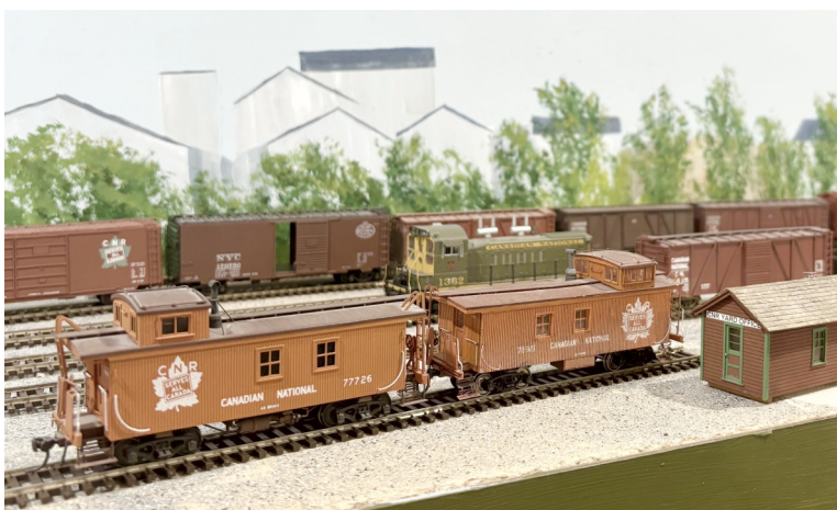
ABOVE: The operating sessions and the layout tours are two of the most popular RMMBC activities. This photo show Al Lil's layout, which will be holding one of the operating sessions.

Click here to sign up for the RMMBC newsletter.