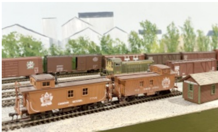
ABOVE: The operating sessions and the layout tours are two of the most popular RMMBC activities. This photo show Al Lil's layout, which will be holding one of the operating sessions.

Click here to sign up for the RMMBC newsletter.