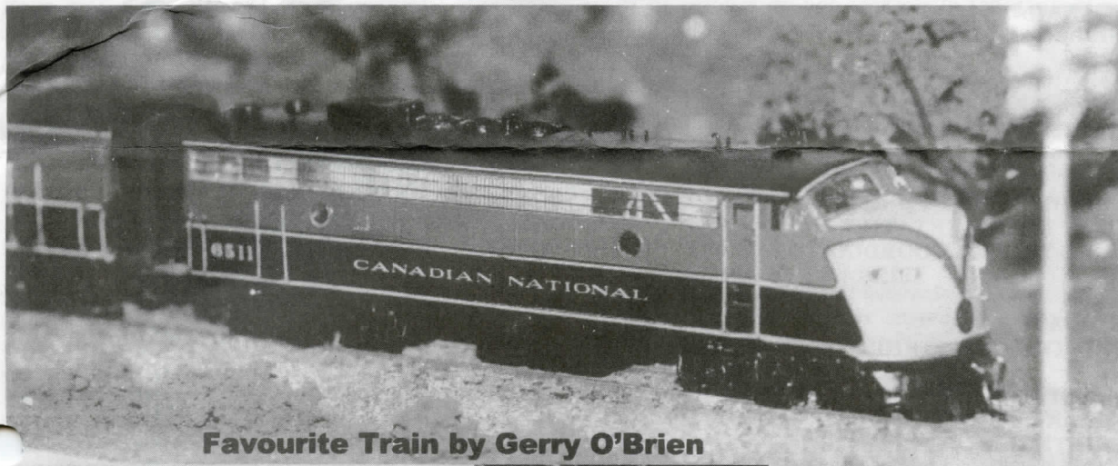
Favourite Train by Gerry O'Brien

Please see Page 7 for a full report on the recent Interior Spring Meet: "Shuswap Rails 2000" held in Salmon Arm, BC