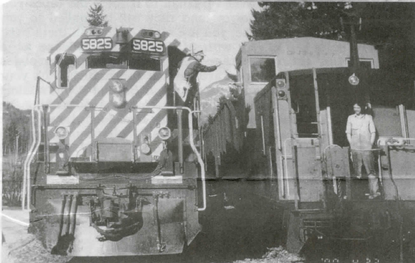
Prototype Photo winner "Friendly Meet" by John Zuk

Please see Page 7 for a full report on the recent Interior Spring Meet: "Shuswap Rails 2000" held in Salmon Arm, BC