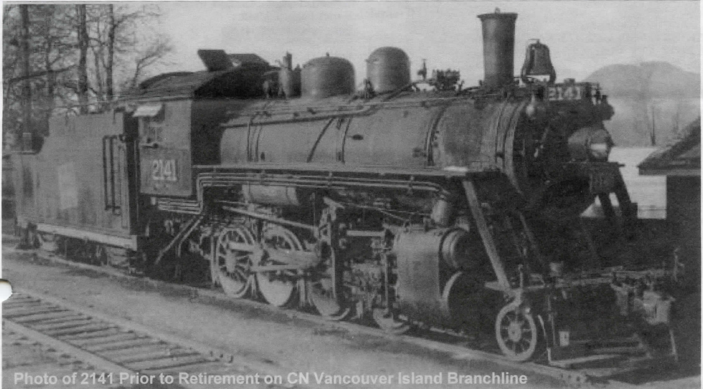
Photo of 2141 Prior to Retirement on CN Vancouver Island Branchline

The Official Publication of the 7th Division, Pacific Northwest Region National Model Railroad Association (Canada)