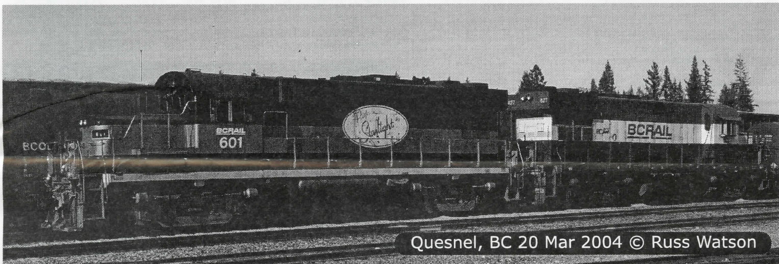
Quesnel, BC 20 Mar 2004

The Official Publication of the 7th Division, Pacific Northwest Region, National Model Railroad Association (Canada)