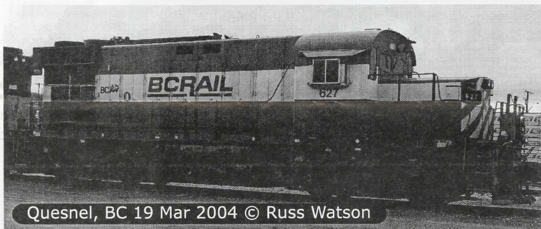
Quesnel, BC 19 Mar 2004

BCR 601 and 627 started life as MLW RS-18s but were retrofitted with 2000 HP Caterpillar engines - 601 in 1994 and 627 in 1991. The 16 cylinder Caterpillar 3516 turbo charged engines produce a continuous rating of 2075 HP. The